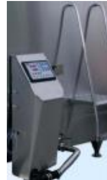
Ergonomic stainless steel control panel with electronic control unit with automatic washing system, with 76mm or 51mm drain valve and low voltage dosing pumps for automatic detergent intake.