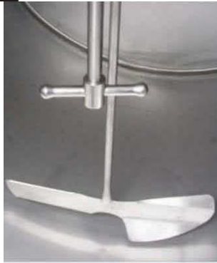
Stainless steel washing diffuser separate from agitation system.

Inox Machinery Manufacturers For Food & Milk Industries